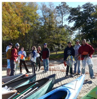
Getting ready to launch