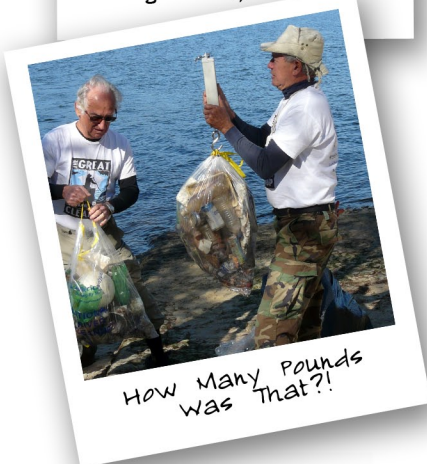
How Many Pounds was That?!