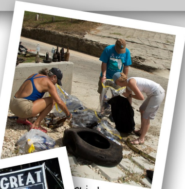
...rial park Ramp